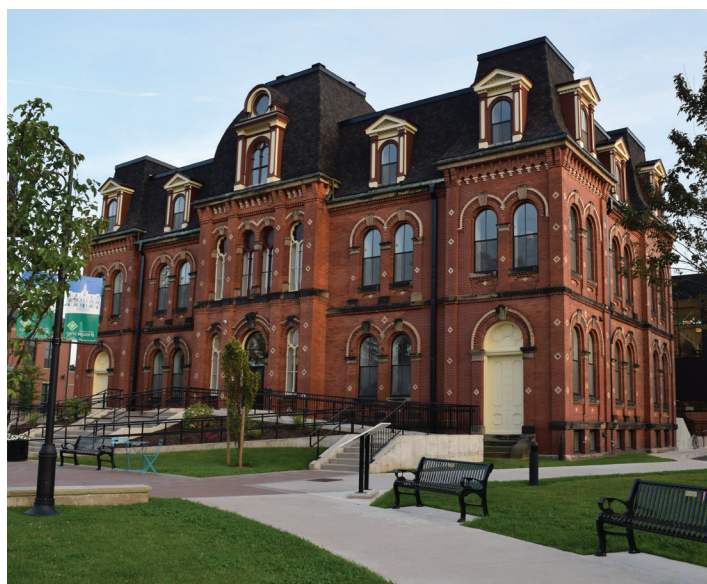
Truro Library. Permission for use from Colchester-East Hants Regional Library