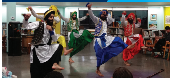
Bhangra Dancers.

AVR – Annapolis Valley Regional Library CBR – Cape Breton Regional Library CEH – Colchester-East Hants Public Library CPL – Cumberland Public Libraries ECR – Eastern Counties Regional Library HPL – Halifax Public Libraries PAR – Pictou-Antigonish Regional Library SSP – South Shore Public Libraries WCR – Western Counties Regional Library