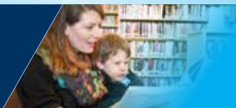
Permission for use of image from Cape Breton Regional Library

My daughters love the library. The excellent programs always make our day better! – CBR patron