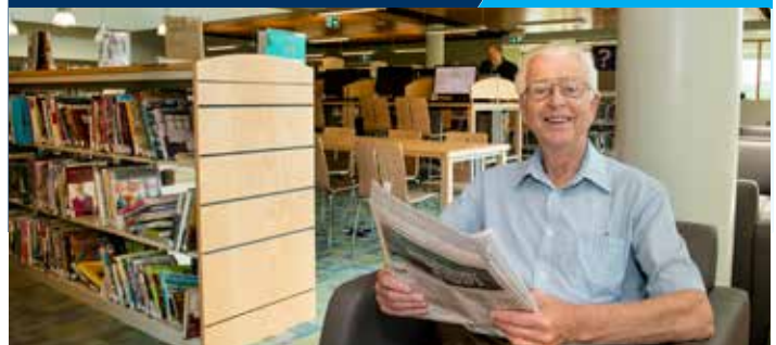
Permission for use from South Shore Public Libraries