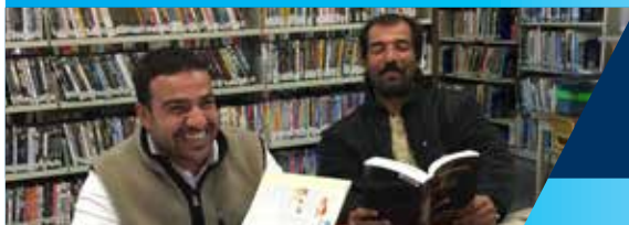
Permission for use of image from South Shore Public Libraries

322,000 Active library users 36,000 New library users